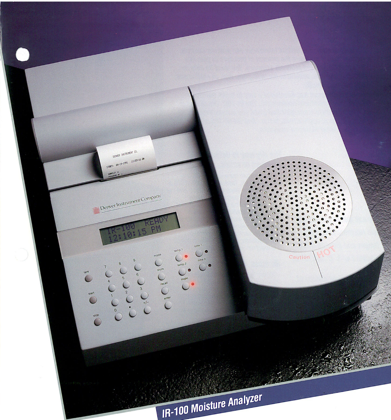
IR-100 Moisture Analyzer